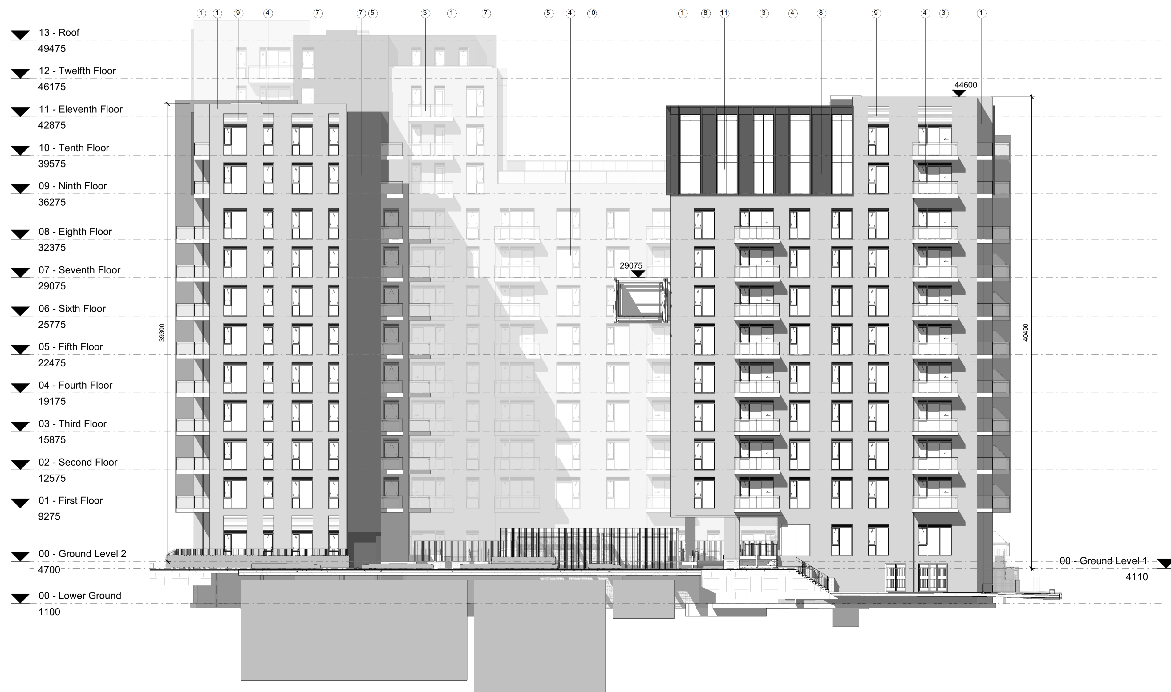
2 Block 1 - South Elevation 1 : 200

NOTE ALL DIMENSIONS TO BE CHECKED ON SITE NO DIMENSIONS TO BE SCALED FROM THIS DRAWING THIS DRAWING IS TO BE READ IN CONJUNCTION WITH RELEVANT CONSULTANTS DRAWINGS