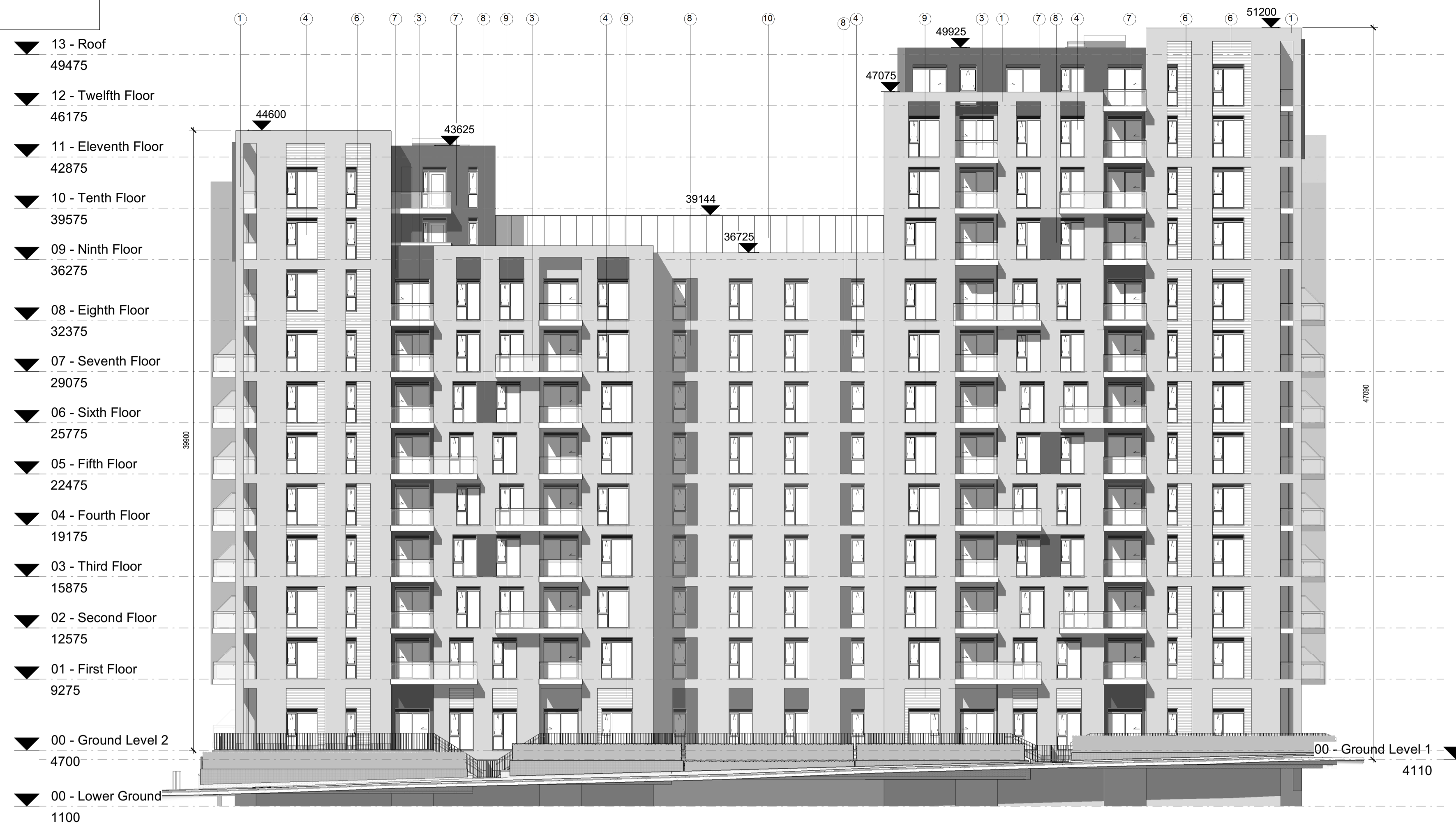
1 Block 1 - North Elevation 1 : 200