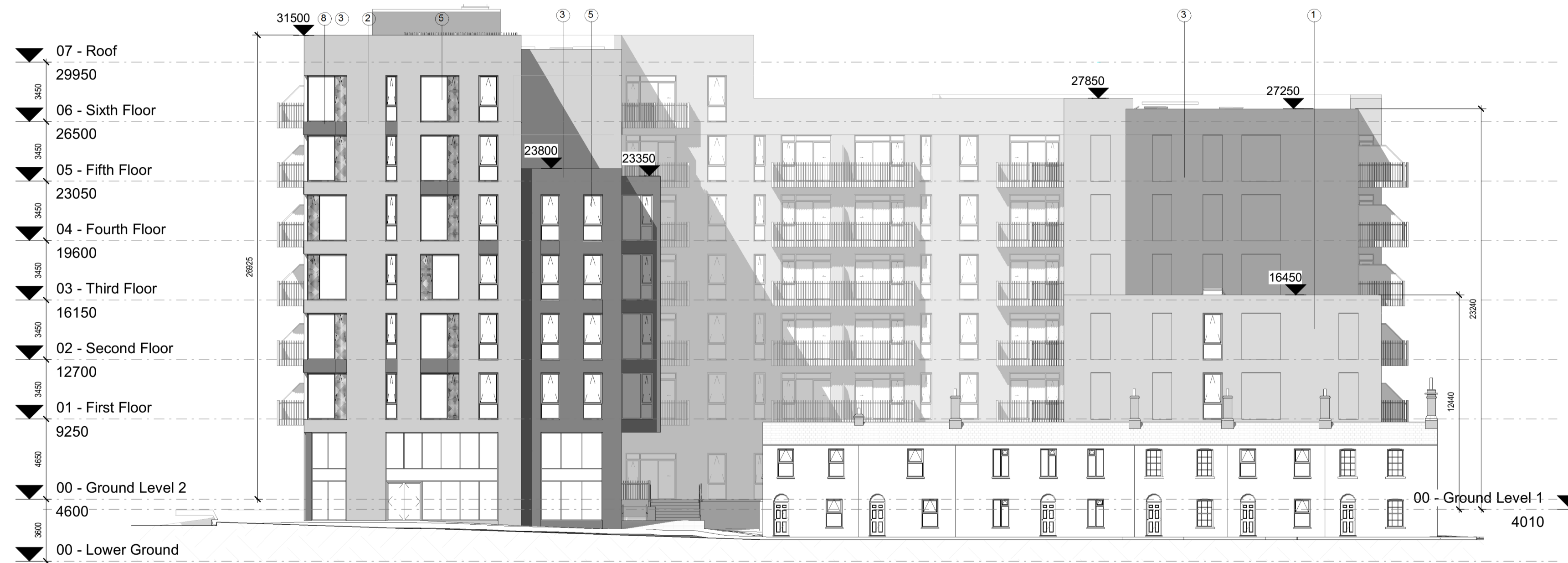
2 Block 2 - South Elevation 1 : 200