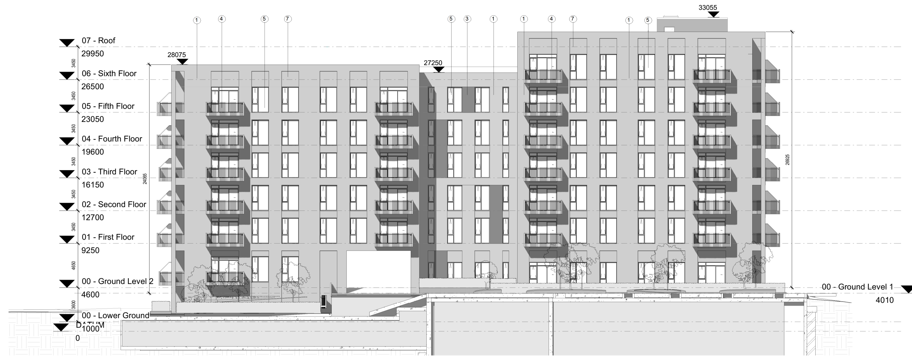
1 Block 2 - North Elevation 1 : 200

NOTE ALL DIMENSIONS TO BE CHECKED ON SITE NO DIMENSIONS TO BE SCALED FROM THIS DRAWING THIS DRAWING IS TO BE READ IN CONJUNCTION WITH RELEVANT CONSULTANTS DRAWINGS