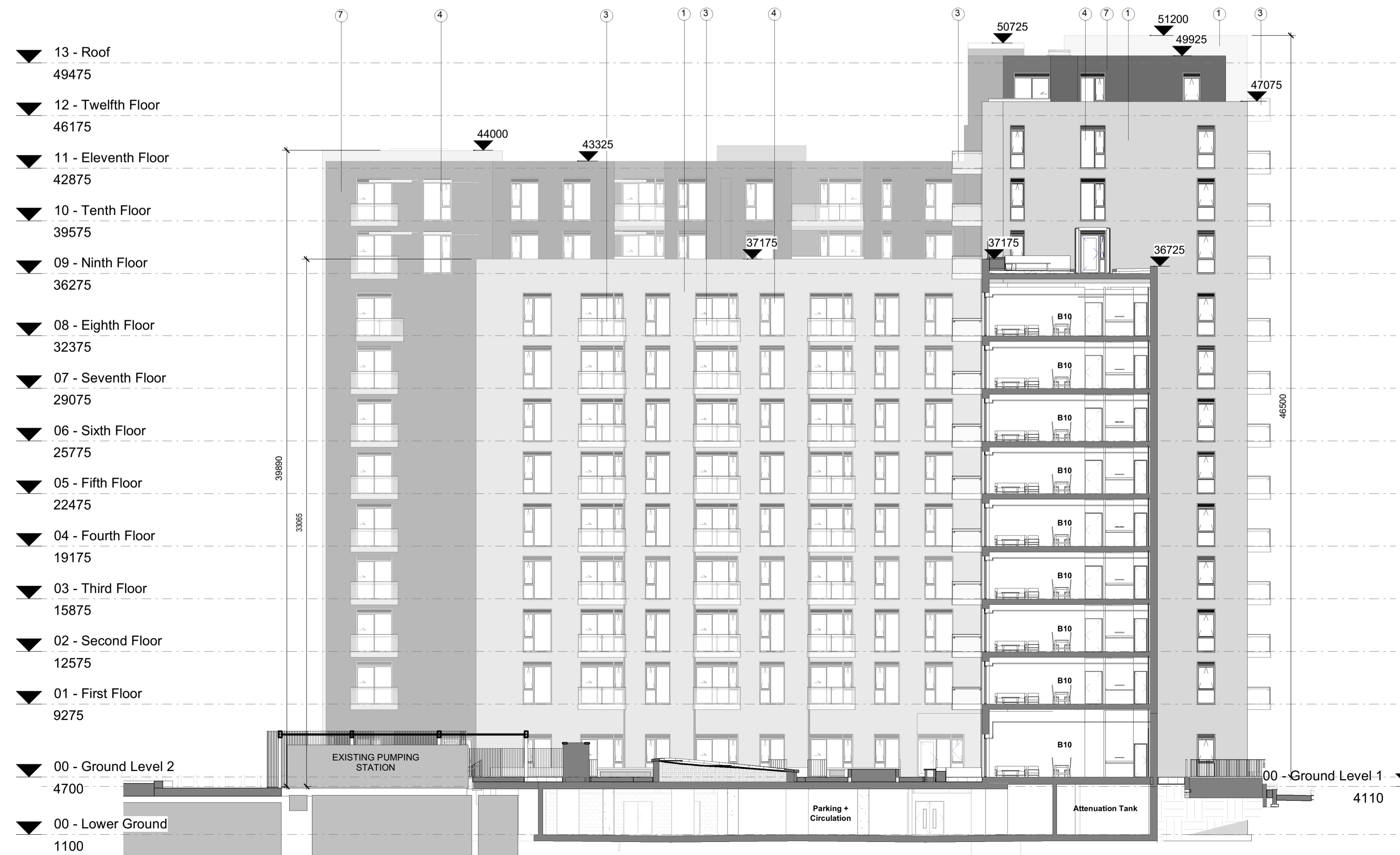
2 Block 1 - Section D-D 1 : 200