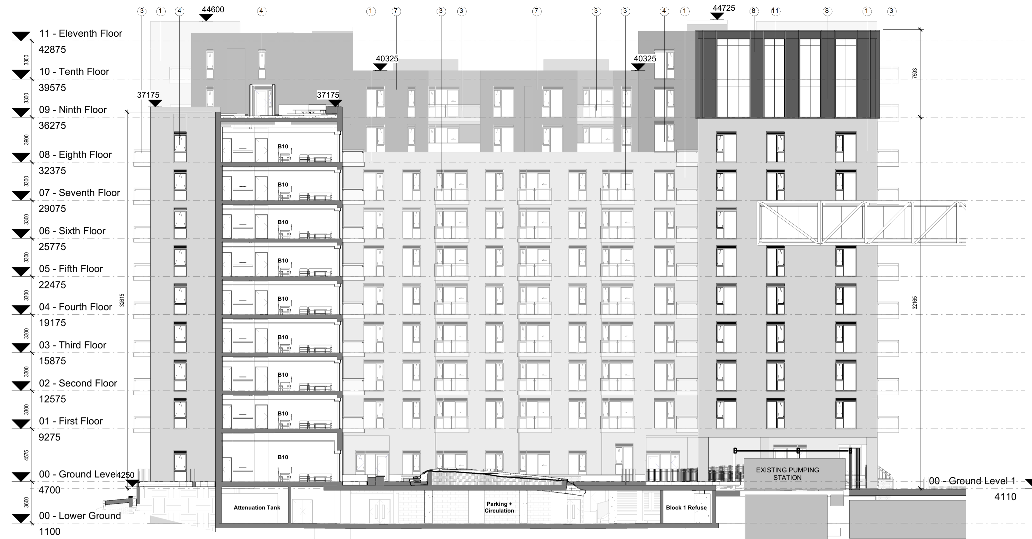
1 Block 1 - Section C-C 1 : 200

NOTE ALL DIMENSIONS TO BE CHECKED ON SITE NO DIMENSIONS TO BE SCALED FROM THIS DRAWING THIS DRAWING IS TO BE READ IN CONJUNCTION WITH RELEVANT CONSULTANTS DRAWINGS