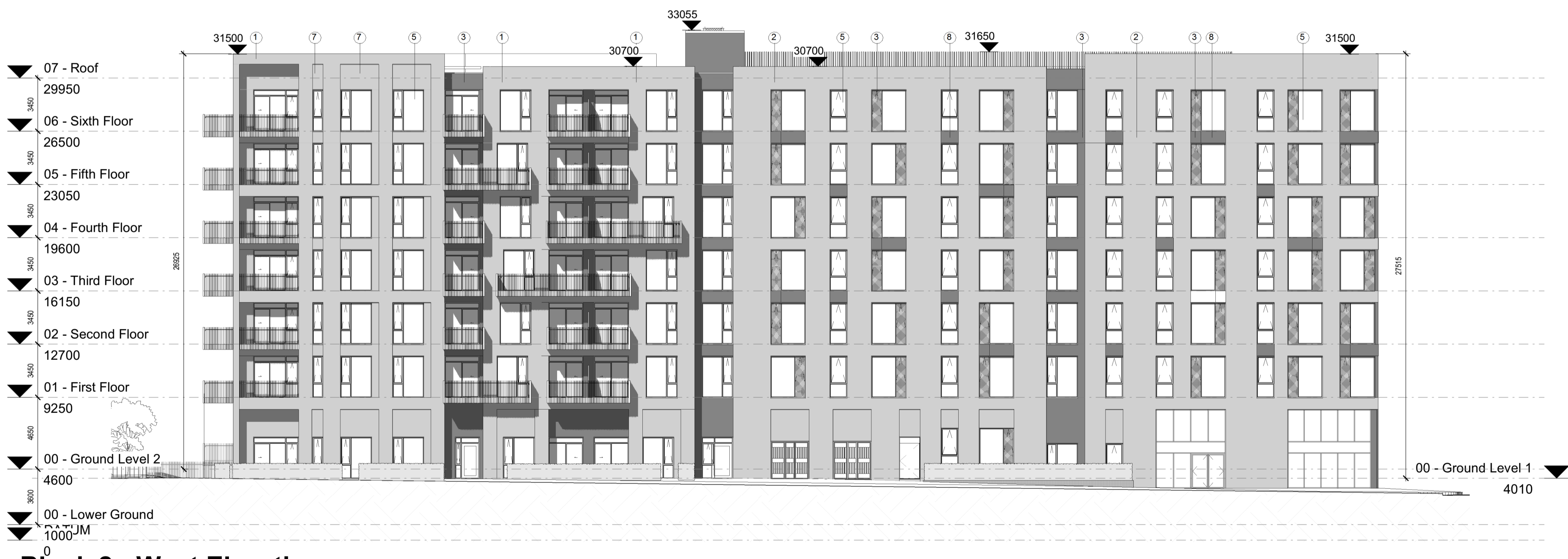
2 Block 2 - West Elevation 1 : 200

DRAWING ISSUED FOR PLANNING APPLICATION NUMBER: DSDZ4279/18 GRANTED: 18/12/2018