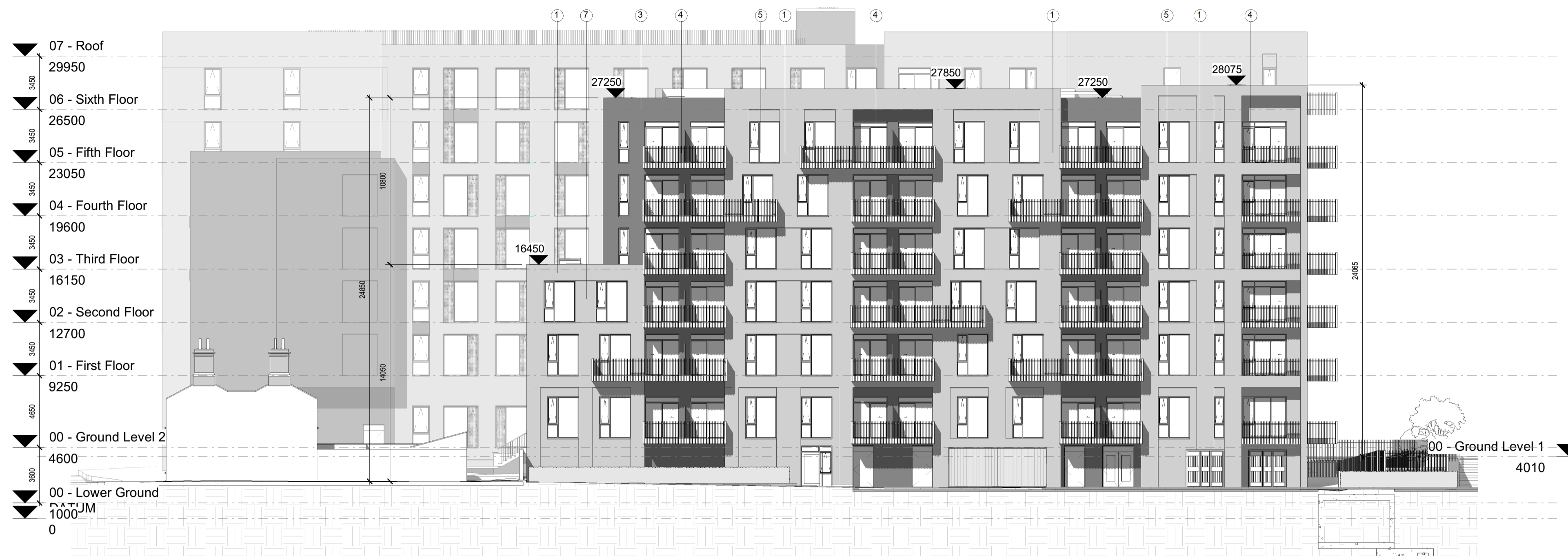
1 Block 2 - East Elevation 1 : 200

NOTE ALL DIMENSIONS TO BE CHECKED ON SITE NO DIMENSIONS TO BE SCALED FROM THIS DRAWING THIS DRAWING IS TO BE READ IN CONJUNCTION WITH RELEVANT CONSULTANTS DRAWINGS