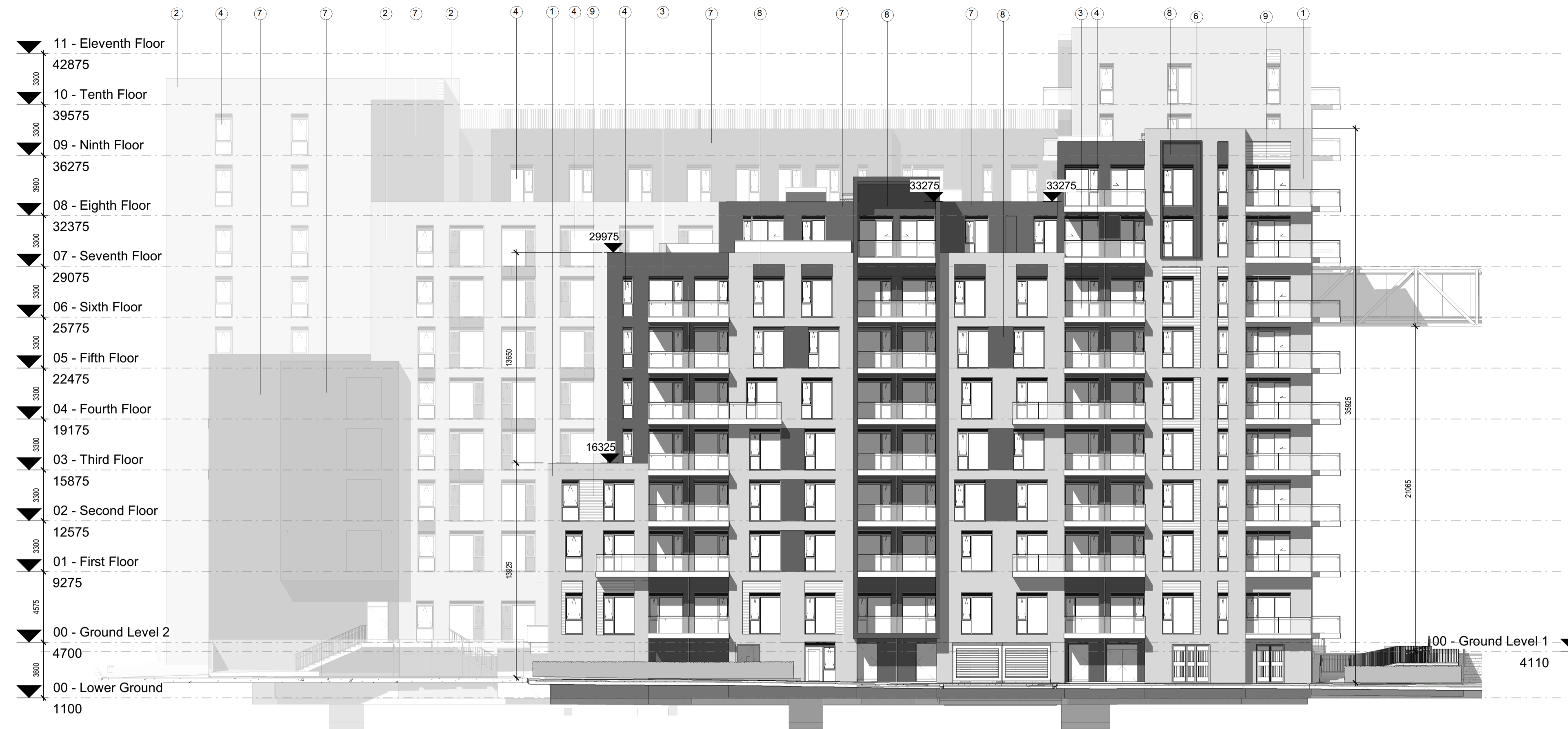
1 Block 2 - East Elevation 1 : 200

NOTE ALL DIMENSIONS TO BE CHECKED ON SITE NO DIMENSIONS TO BE SCALED FROM THIS DRAWING THIS DRAWING IS TO BE READ IN CONJUNCTION WITH RELEVANT CONSULTANT'S DRAWINGS