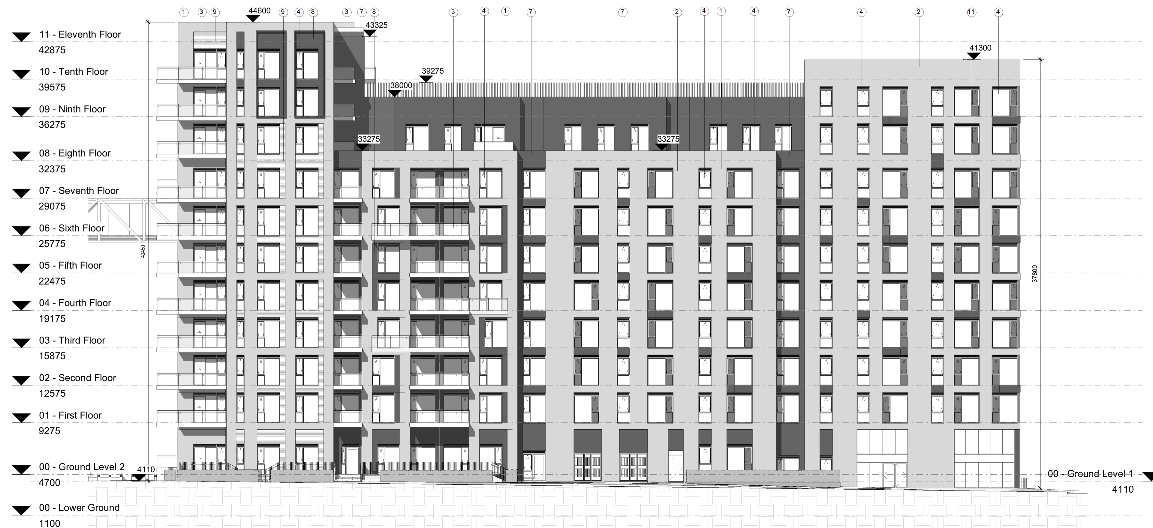
2 Block 2 - West Elevation 1 : 200