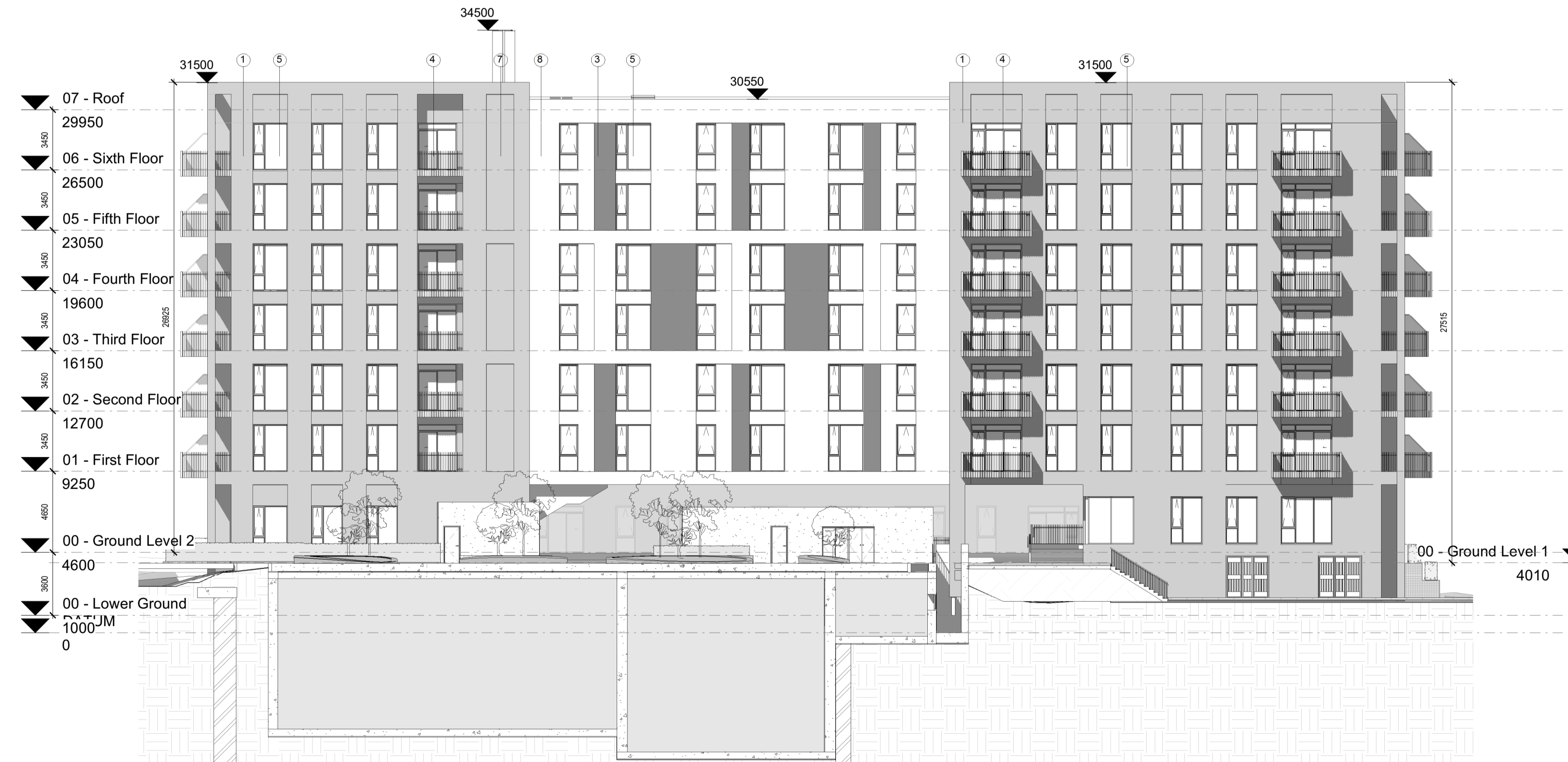
2 Block 1 - South Elevation 1 : 200