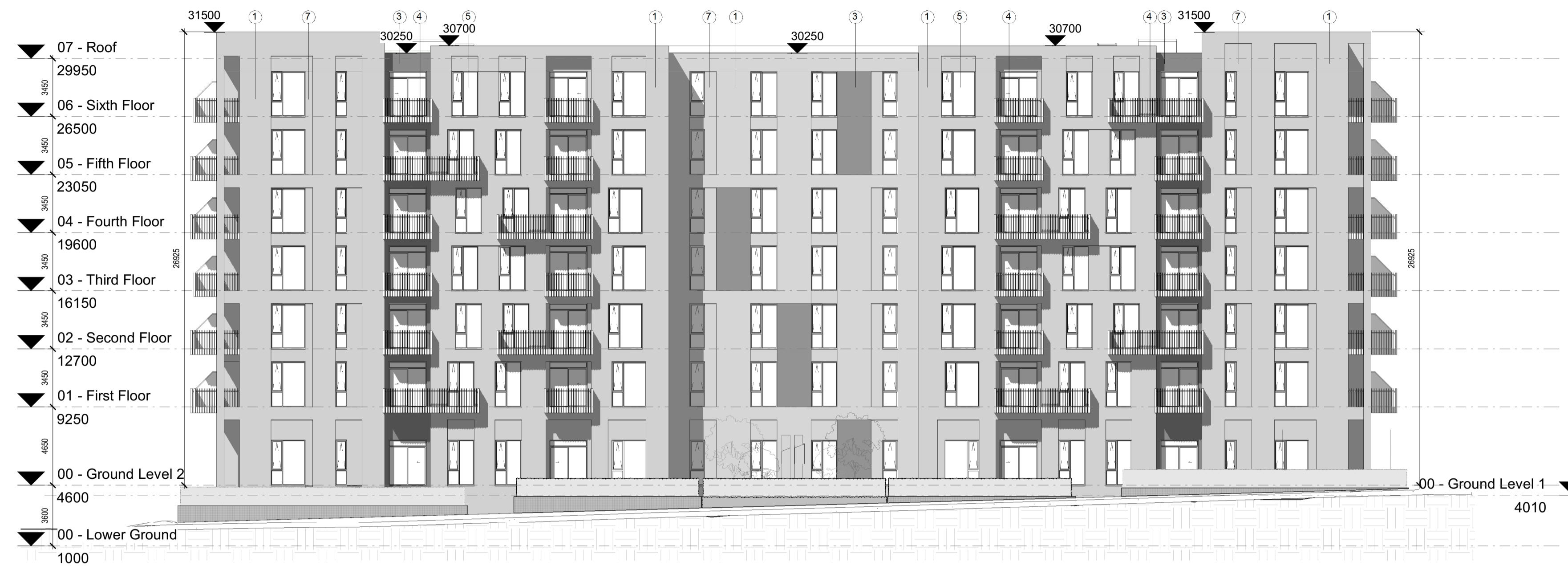
1 Block 1 - North Elevation 1 : 200

NOTE ALL DIMENSIONS TO BE CHECKED ON SITE NO DIMENSIONS TO BE SCALED FROM THIS DRAWING THIS DRAWING IS TO BE READ IN CONJUNCTION WITH RELEVANT CONSULTANTS DRAWINGS